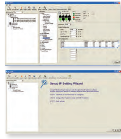
Monitoring and Configuration interface